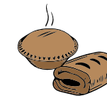
Party Pies & Sausage Rolls